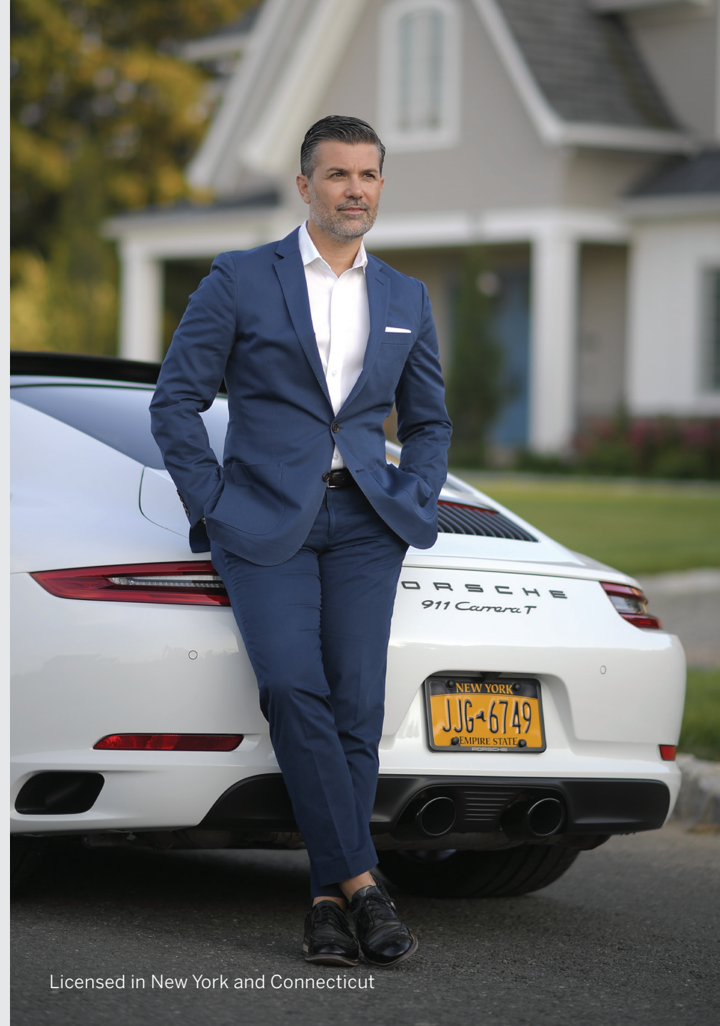
Licensed in New York and Connecticut